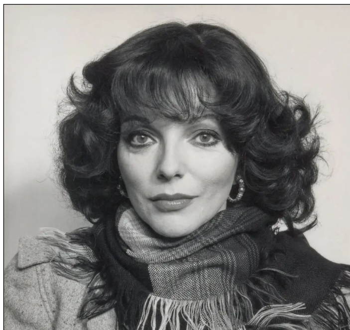
Joan Collins in 1979