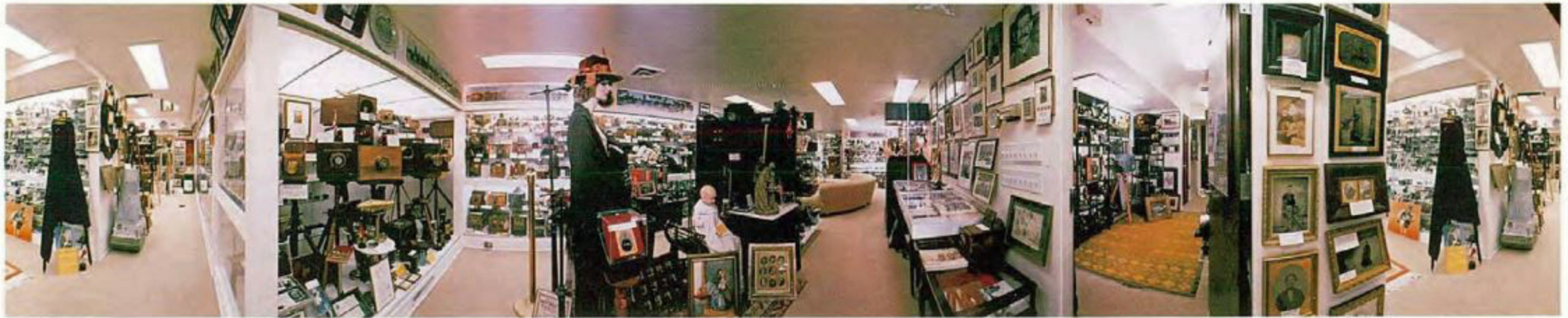
Harold Lewis photo