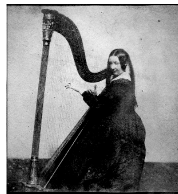
Horatia With Harp, 1843

“Talbot had begun tinkering with photography as early as 1834, and just ten years later would issue the latter book, a work for which he is perhaps best known and that is considered to be the first photographically illustrated text to be commercially sold (as opposed to sold by subscription).”