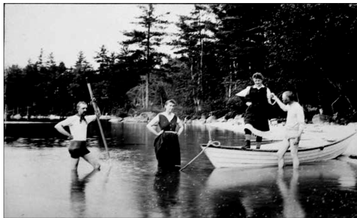
At Blodgetts Landing, the women are dressed in conventional bathing attire for the times, but the costumes of the men are rather unconventional.

“The beautiful scenery of the Lake Sunapee region not only attracted tourists but also skilled photographers. From 1880 on, these photographers made views of the scene, including the development along the lake, and sold them as ‘souvenirs’ for visitors to take home to show family and friends.